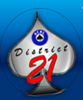
Table Mountain RegionalOctober 9 to October 14, 2023