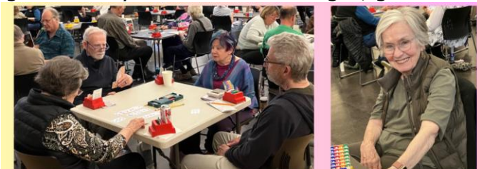
Unit 509 Spring Sectional March 7 & 8, 2026