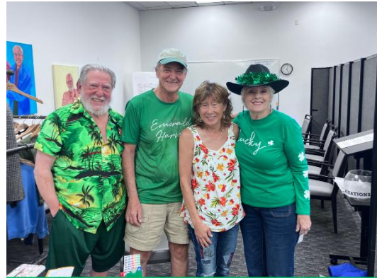
Hawaiian St. Patrick's Day?

March was an amazing month for the Reno Bridge Club** of the Matthewson Bridge Center. The table count of 406 was an increase of 16% over last year. The operating profit was about $1200 (usually we are underwater). This was the first month in Club history that we had over 400 tables! Thursdays, when we have an open and a 399er game, attracted nearly 100 players. On St. Patrick's Day the table count was 17 and the crowd was festive.