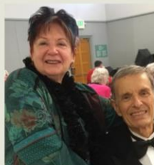
Unit 509 Holiday Party