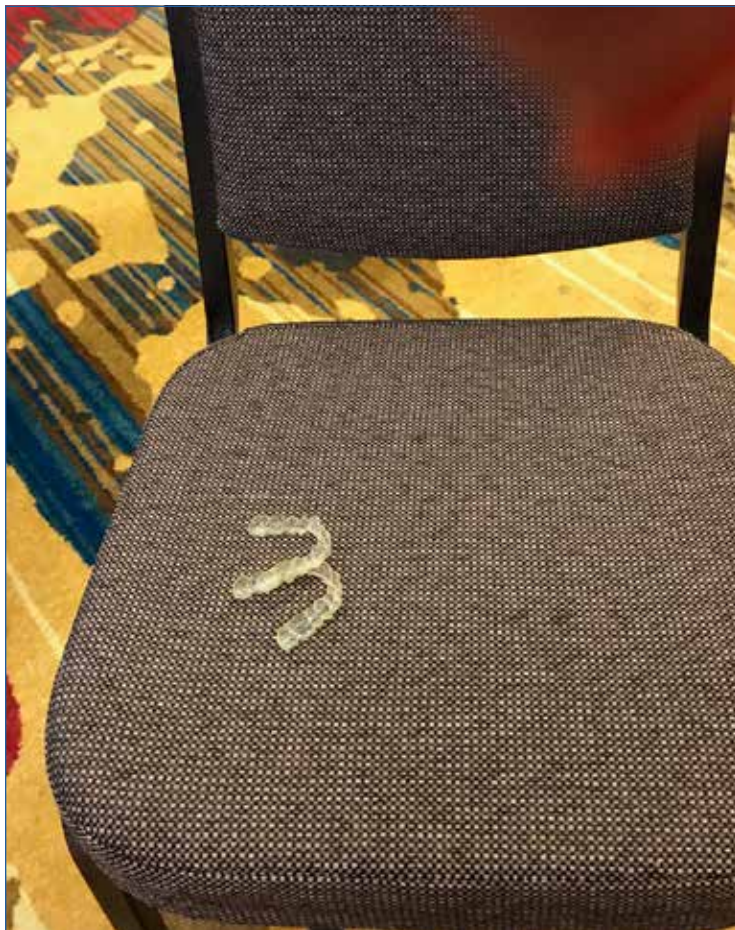
table. There might be one exception. The worst thing I ever found left behind by a Goop was this:

Who leaves their Invisiliners on a chair in a side pair game? Not only that, it was the second round of the game! I checked with the player in my seat in the first round and that person was definitely not missing any Invisiliners.