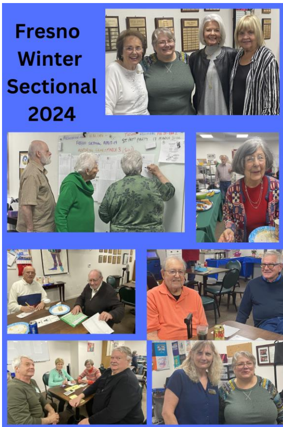
Fresno Winter Sectional 2024

Fresno Winter Sectional: Our sectional took place from Saturday, February 17 th through Monday, February 19 th (Presidents Day Weekend). Great news! It